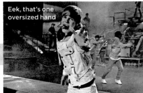
EEK, that's one oversized hand