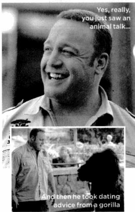
Yes, really, you just saw an animal talk...

ROMCOM Kevin James stars as lovable zookeeper Griffin Keyes in this family flick. Looking for love, he decides to leave the zoo and get a glam job. Upset by this news, the animals pipe up Dolittle-style (yes, they talk!) and break a code of silence to teach him a thing or two about dating. A basic plot with kid-safe jokes, but there are interesting voice cameos with Cher as a lioness and Nick Nolte as a gorilla. ★★★