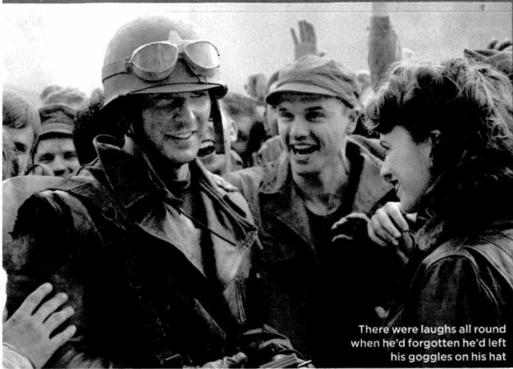
There were laughs all round when he'd forgotten he'd left his goggles on his hat